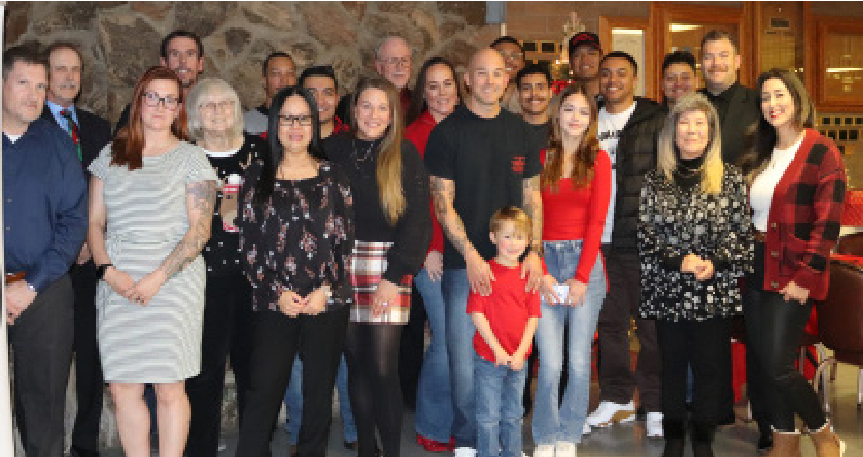
AAO CH1 HOLIDAY PARTY DEC 23