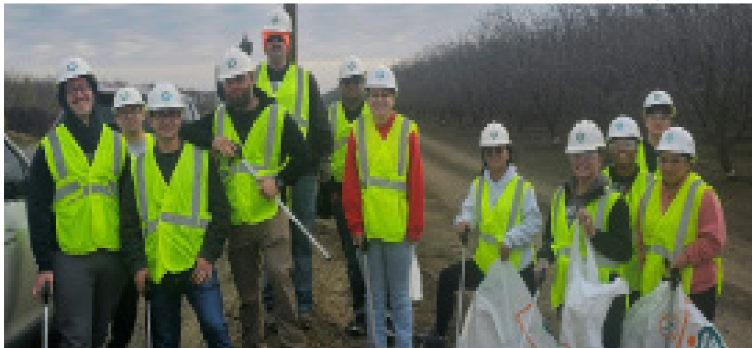
AAO CH1 ADOPT A HIGHWAY JAN 24