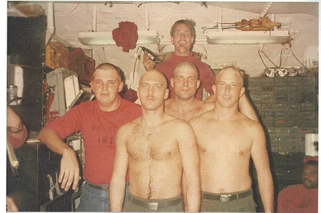
VA-81 Circa 1984, Cruise Cuts!!!