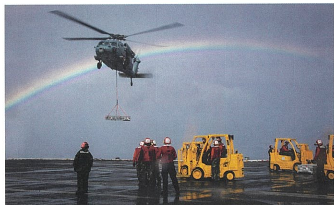
USS CARL VINSON G-1 Flight Deck executes a successful ammo onload, rain or shine!