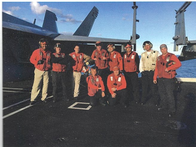
VFA-86 USS Dwight D Eisenhower