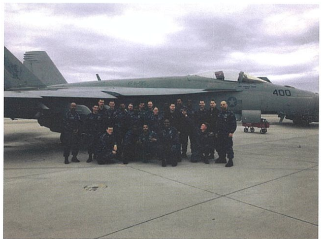
VFA-195 Fallon Det 2017