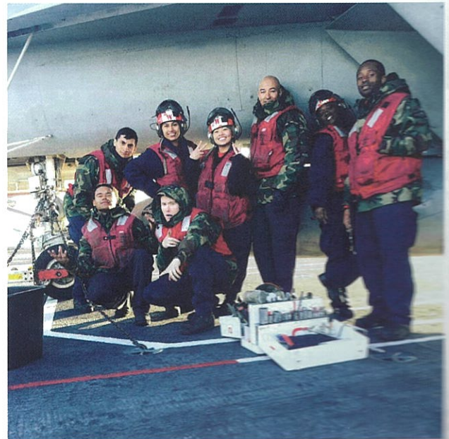
VFA-137 West Pac 2017