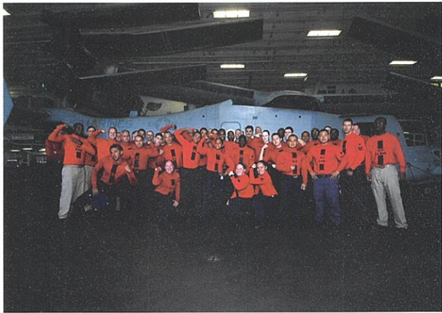
USS Makin Island