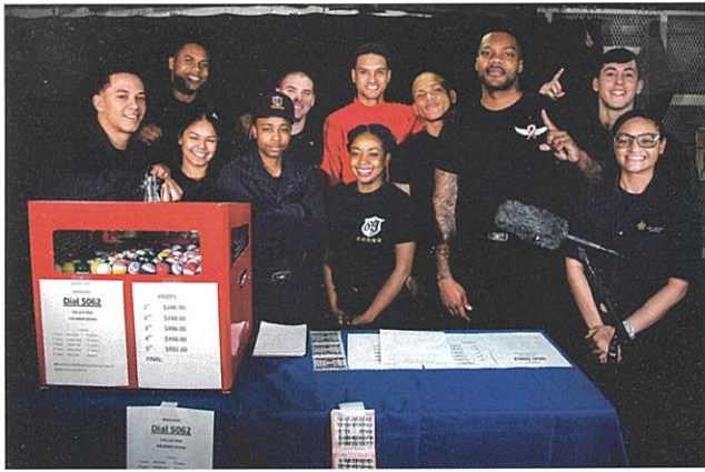
Chapter 69 Running Bingo