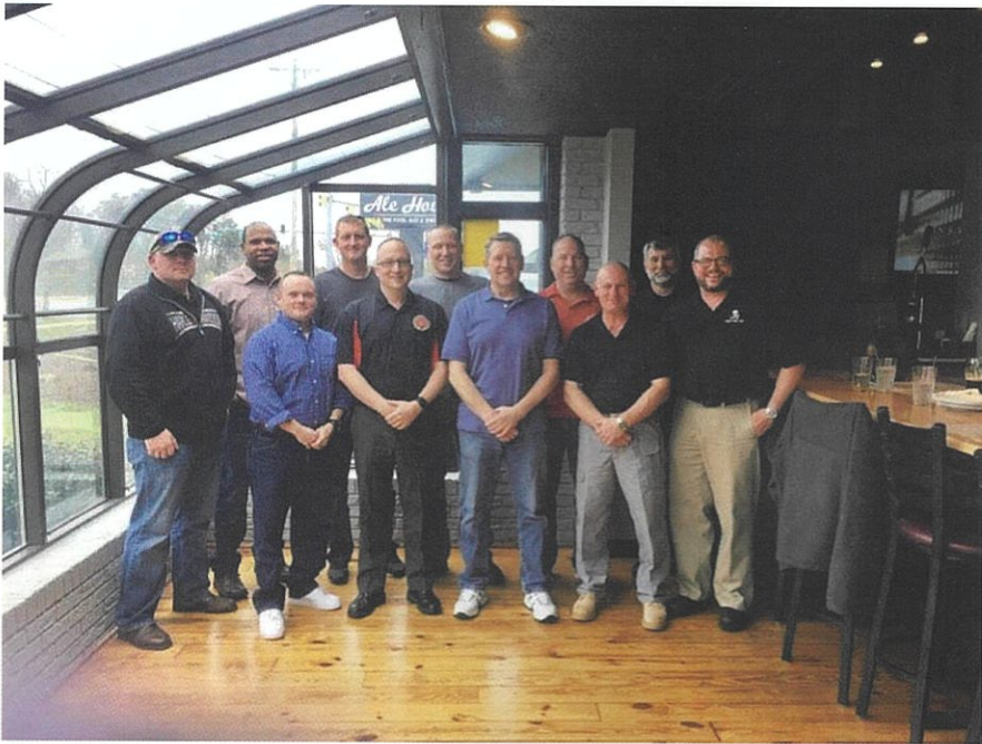
Ordnance Officers in Pax River, MD