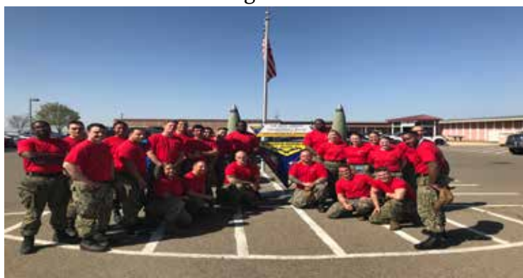
All the hard work, training and dedication paid off.

They conducted their CWTPPI on March 30th, 2021 with a perfect score. The camaraderie, pride and dedication is what the Ordnance community is all about, and they definitely showed us their AO pride.