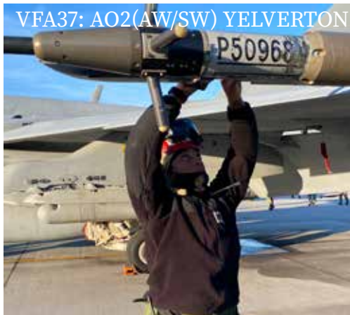
VFA37: AO2(AW/SW) YELVERTON