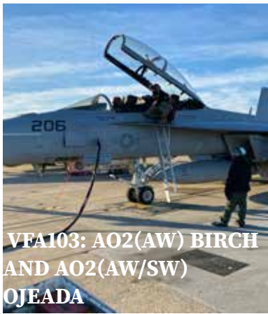
VFA103: AO2(AW) BIRCH AND AO2(AW/SW) OJEADA