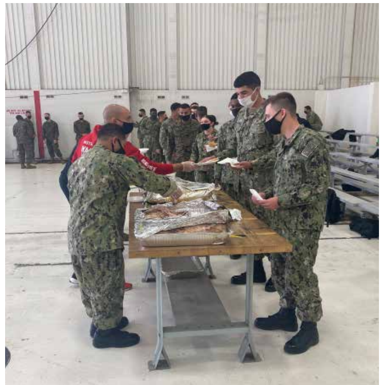
Chapter 34 Thanksgiving