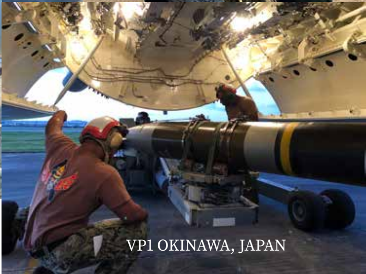
VP1 OKINAWA, JAPAN